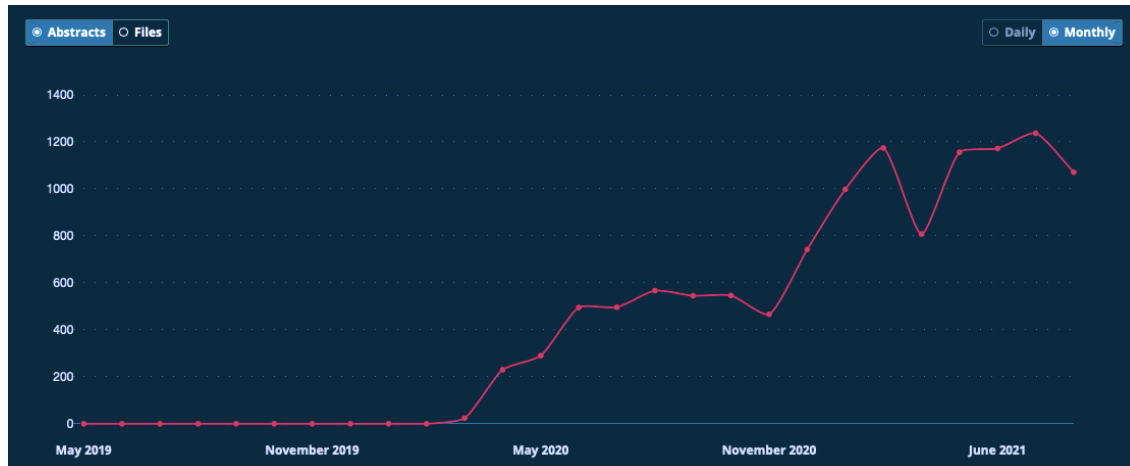
Figure 2 - Abstracts views of APN website in the past two years.

In our modern globalized academic community, APN recognizes the importance of international collaborations, and seeks to promote itself as an international journal. We have organized a series of articles focusing on important topics in various fields, and invited international prominent experts to co-author.